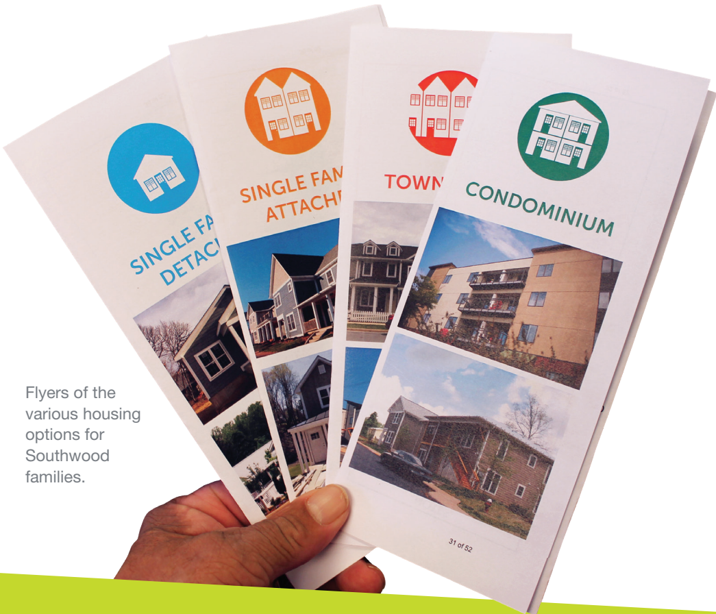
Flyers of the various housing options for Southwood families.

Providing the chance for groups of families to design their new neighborhoods, offering expanded housing choices and creating a way for rental equity to accrue to the benefit of the community members are three of many ways that Habitat is amplifying residents’ total “ownership” stake in the community. At Habitat, we believe that our revolutionary model of home ownership, which has resulted in bridges out of poverty for millions of families globally, can and must be extended to community-wide ownership in order for redeveloped neighborhoods to be successful, sustainable and cared for over the long term.