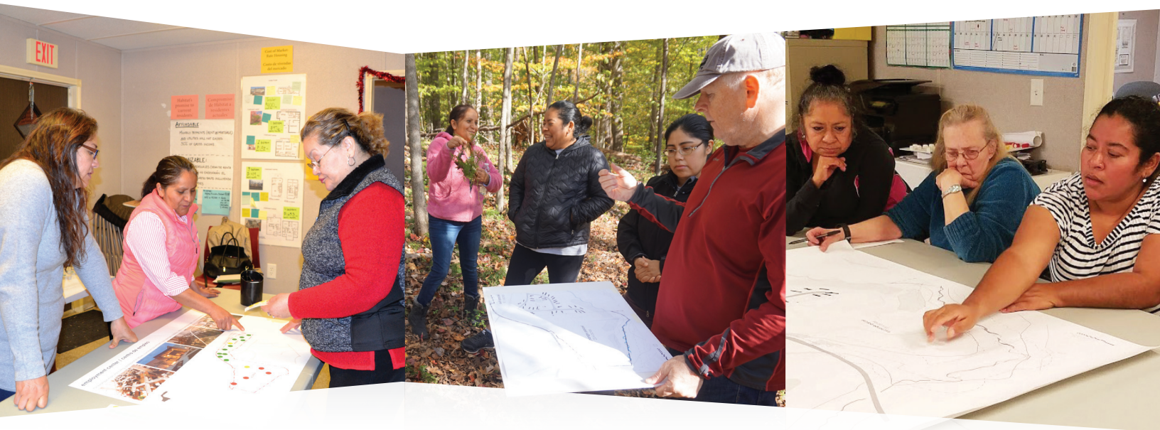
Community members have worked hard to plan the first phase of building a vibrant new Southwood.