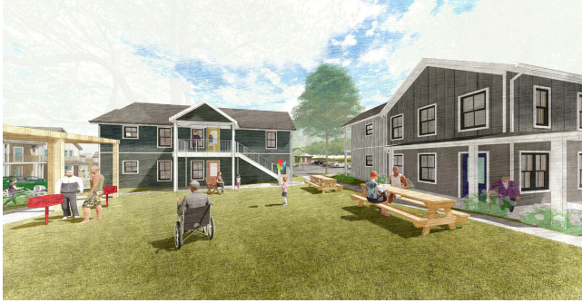
The first Habitat homes to be completed by summer 2022