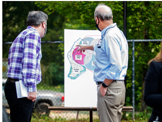
Habitat supporters gathering at the Southwood Groundbreaking in Fall 2020.

Southwood is a very large and complex project. We are taking steps to proactively communicate with the neighborhood and community at large, but we know tensions can run high during periods of transition and misinformation and/or incomplete information can be a challenge. If you or someone you know has questions about the project, please connect with a Habitat staff person. We are deeply committed to transparency and appreciate any opportunity to hear your concerns and to share accurate information about work at Southwood.