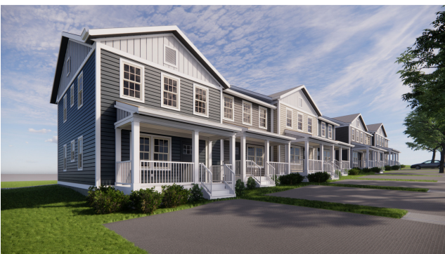
Habitat homes in redeveloped Southwood