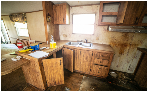
SW trailer before renovation (above); SW trailer after Habitat trailer rehab work is completed (below).

Applicants who registered to live in the Park after November 2019 signed a Move In Notice (MIN) that indicated their pad would only be available for a short time due to redevelopment. Once physical redevelopment began in early 2021, Habitat stopped accepting new renters. In the fall of 2021, physical redevelopment activities - including extensive health and safety remediation efforts - required that Habitat begin issuing its first few notices to post-November-2019 arrivals letting them know that they would need to move. Seventeen families moved in after November 2019 and Habitat will continue to accommodate as many of those families for as long as it is feasible. Additionally, Habitat will offer housing navigation assistance to anyone who seeks it.