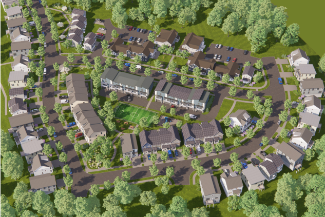
Village One aerial rendering.

The 317 families who were living in the Park in November 2019 will have the option of an onsite affordable home to purchase through the Habitat Homebuyer Program or an affordable rental. Habitat never charges more than 30% of a family's income toward housing. By December, the first 45 Southwood families will be accepted into the Habitat homebuyers program. In the first phase alone, more than 80 Southwood families will purchase a home with another 10-20 likely choosing to move into affordable rentals.