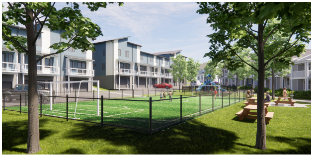
Five Pillars Park at the center of Village One