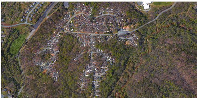
Aerial view of 315 homes in Southwood

Habitat for Humanity is supporting the redevelopment of the Southwood Mobile Park as the non profit owner, developer, and property manager. Habitat purchased the park in 2007 to prevent massive and catastrophic resident displacement and has invested more than $25M to stabilize operations ever since. Long term, Habitat's goal is to turn over complete ownership to the residents themselves in a redeveloped community of sustainable, permanent housing. Read more about the story of how and why Habitat purchased Southwood in 2007.