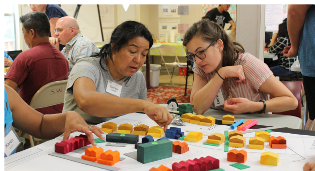
Resident planners working on the site plan.

Families have invested more than 2,500 hours working with engineers, architects, county planners, and Habitat staff as part of the redevelopment process. A resident planning team has steered the efforts through the rezoning process to the site planning. Southwood residents have also taken the lead in many other community-wide initiatives, such as building a youth soccer field, planning community festivals and painting the community center.