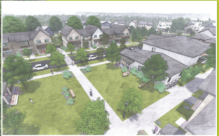
Resident planners determined the range of housing types to be built in Southwood, including single-family detached homes, condominiums, townhomes, and accessory dwelling units (ADUs).