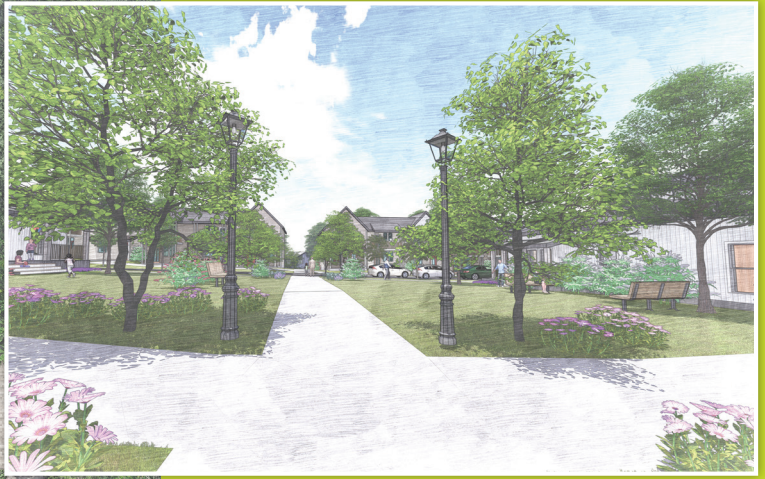
Wide sidewalks, numerous benches, and connected back yards reflect the residents' vision for a community that is safe and family-oriented.