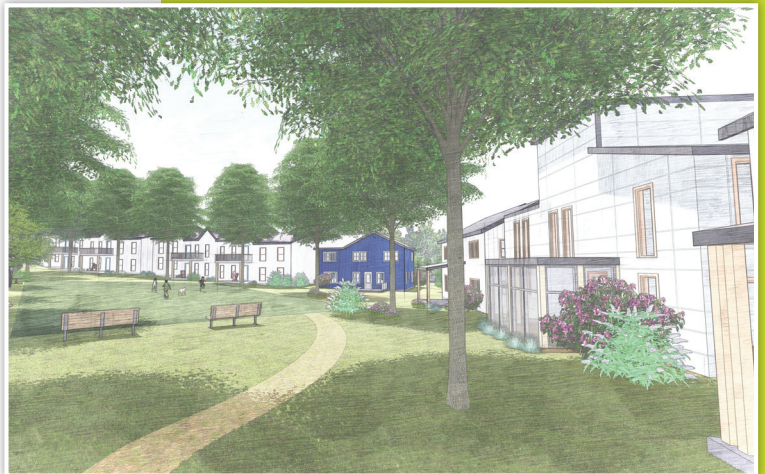
Southwood resident planners felt strongly about prioritizing shared open space in the site plan so children can safely play close to their homes.