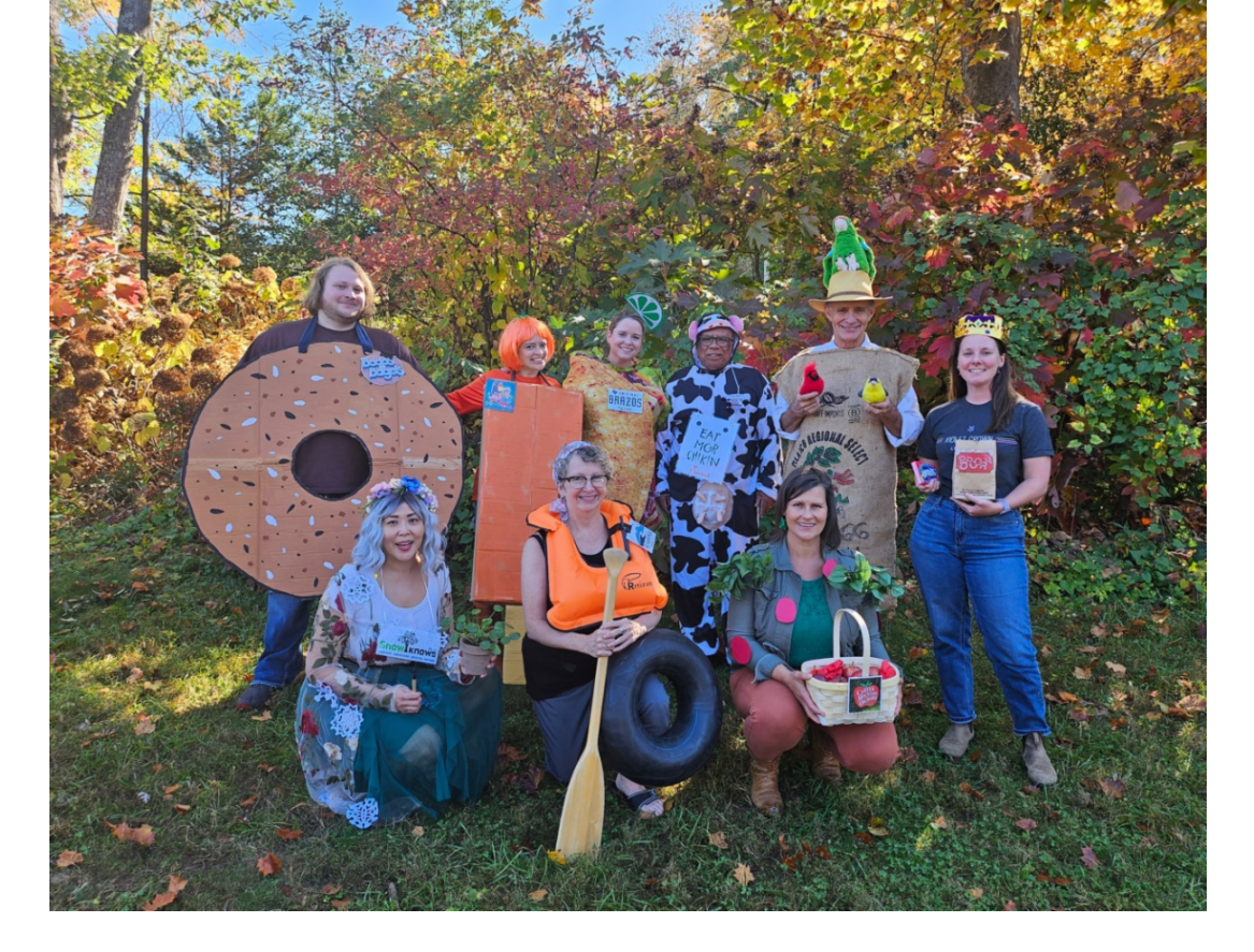
Team Construction - The Minions